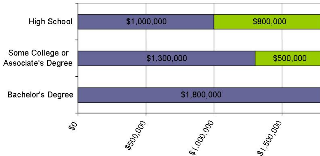
Graph 5.2 - Comparing Educational Attainment and Earnings